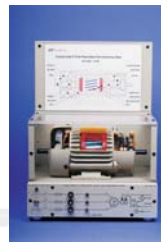
EM-3350-3A Three-phase Salient Pole Synchronous Motor