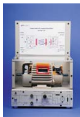
EM-3350-1F DC Compound Wound Motor