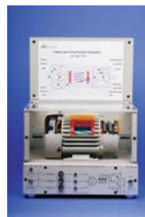
EM-3350-3B Three-phase Rotor Winding Motor