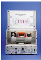
EM-3350-1D DC Shunt Wound Motor