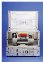
EM-3350-1C Single-phase Induction Motor