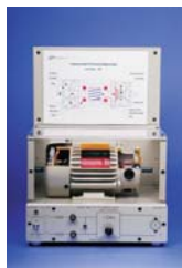
EM-3350-1A DC Permanent-magnet Motor